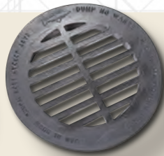
Round Drop in Grate