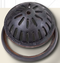
Domed Grate with Frame