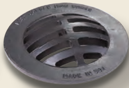
Drop in Domed Grate