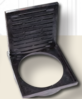
Square Hinged Grate

GPK offers a variety of different grates and covers which can be ordered with the Drain Basins and Inline Drains, including a variety of different load ratings along with pedestrian ADA compliant grates.