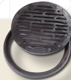
Round Grate with Frame